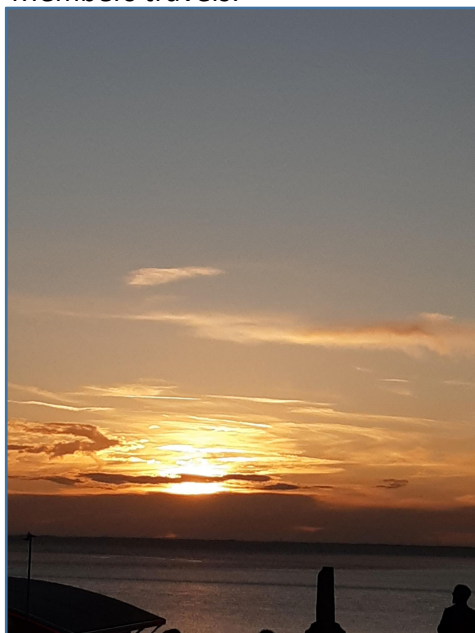
Where did Liz He travel to? A sunset over the East Coast?!!