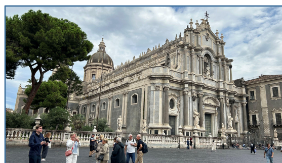
Above: Catania Duomo (cathedral)